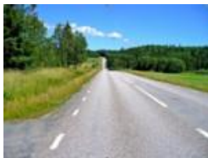
The 'green road'

PrePhalt FBK has been developed to be used in aged brittle bitumen, to improve the rheological properties, up to the properties of new bitumen.